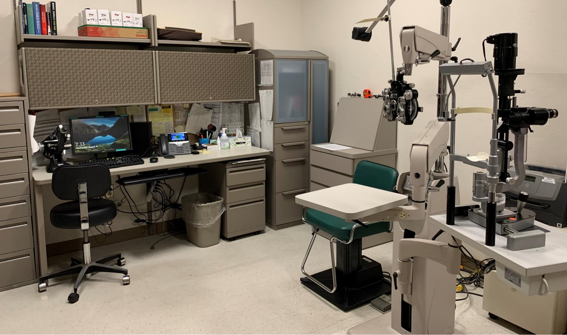
Low Vision Exam Room