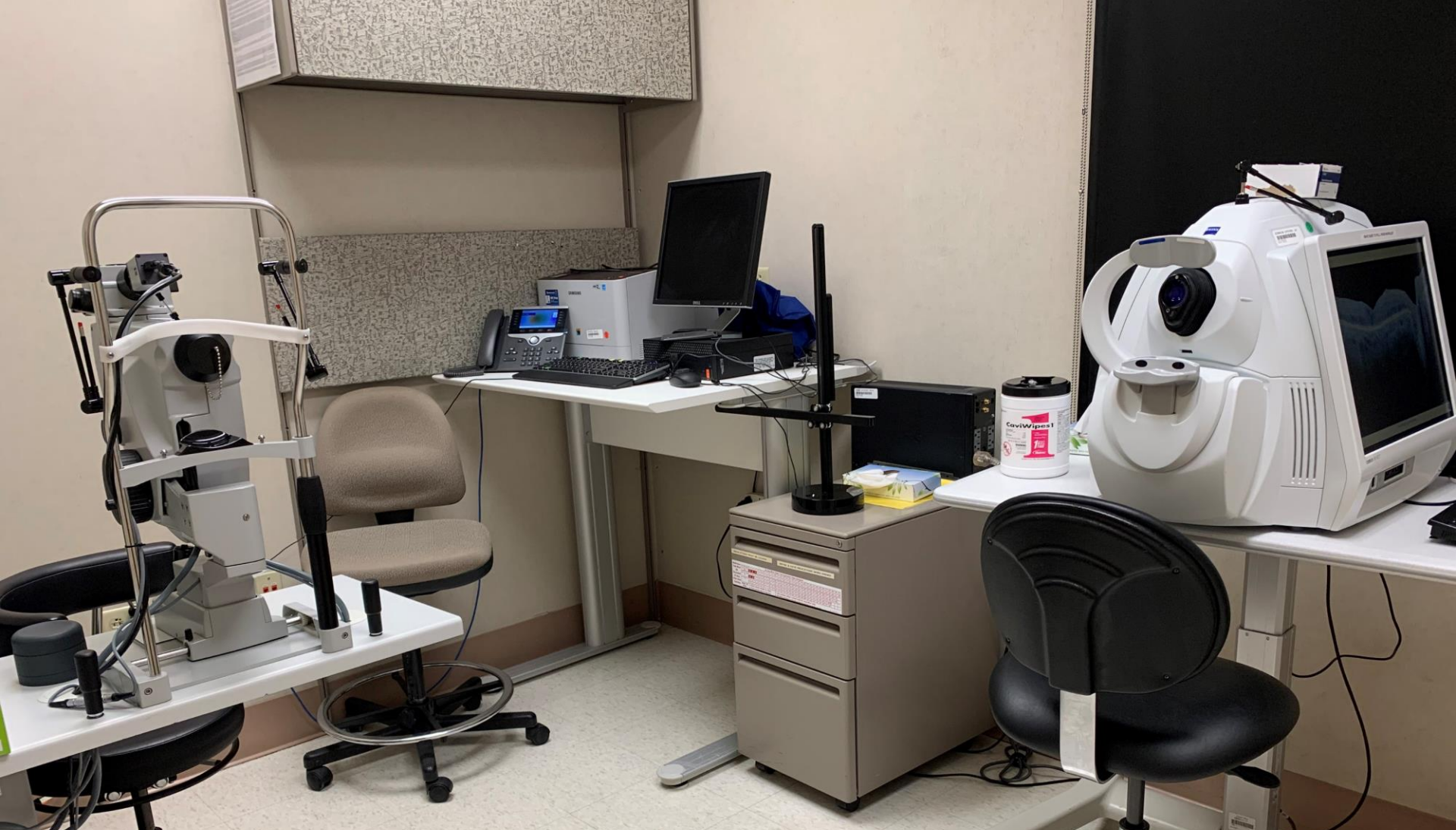
Digital Fundus Camera with Fluorescein Angiography Cirrus-HD OCT