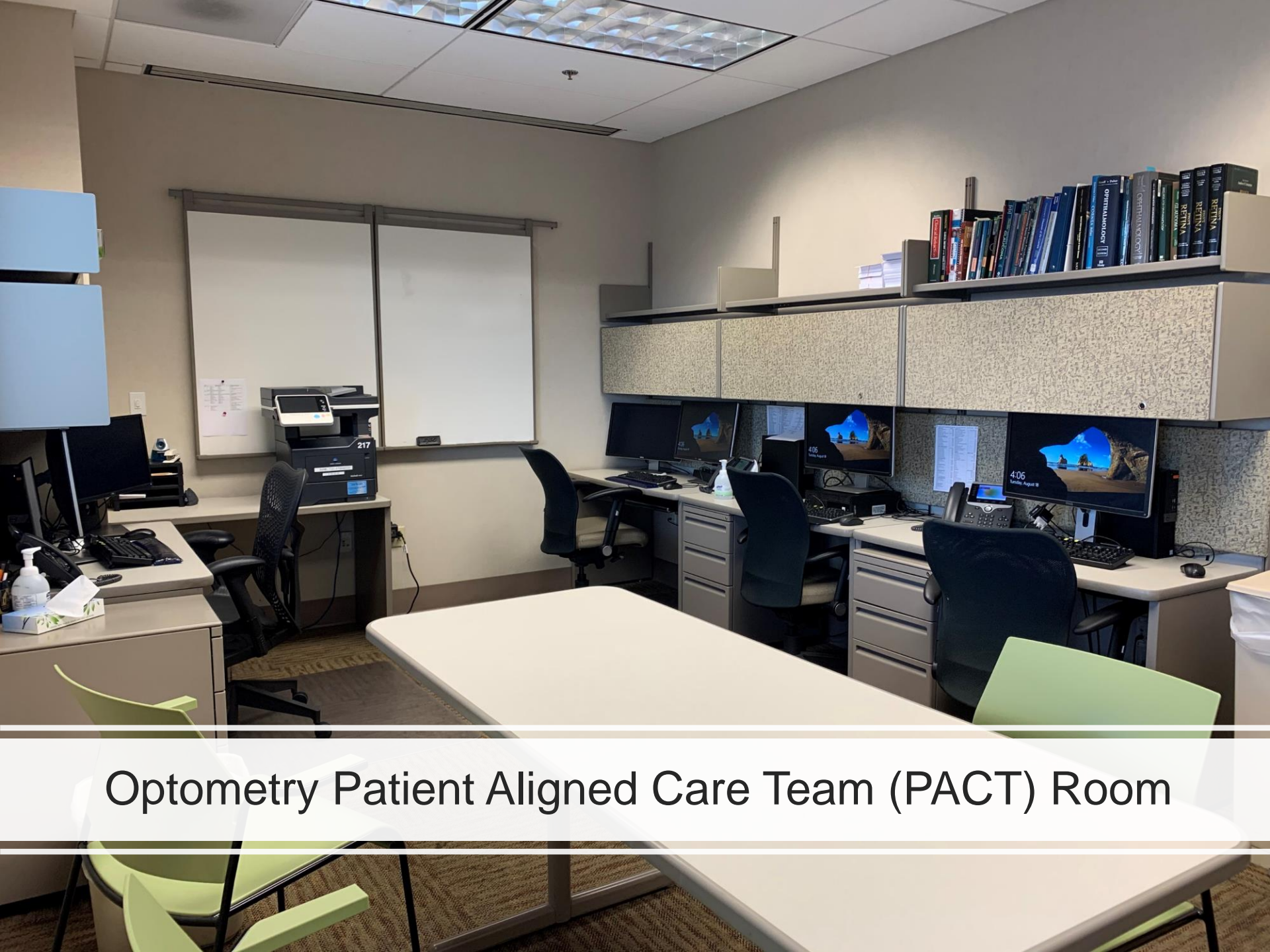
Optometry Patient Aligned Care Team (PACT) Room