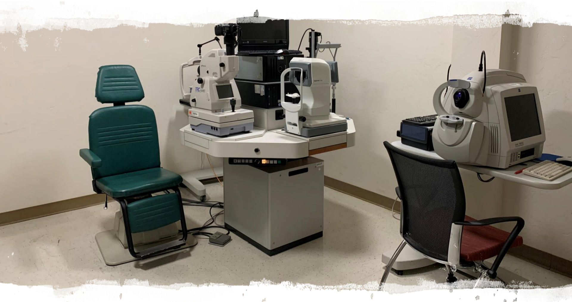
Ocular Health Exam Room