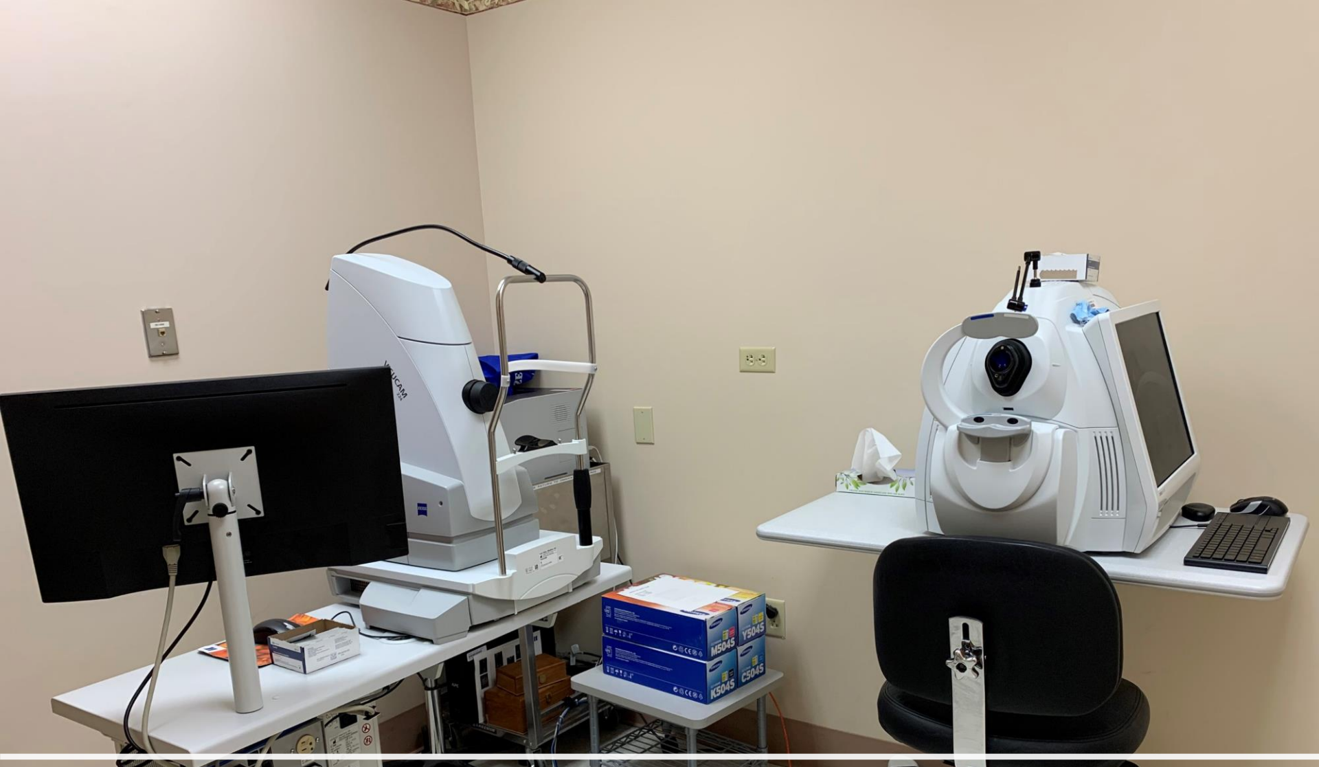
Cirrus-HD OCT with OCT-A Digital Fundus Camera with Fundus Autofluorescence